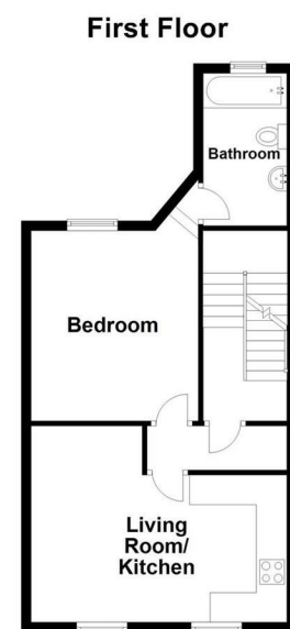
Not to scale. For illustrative purposes only